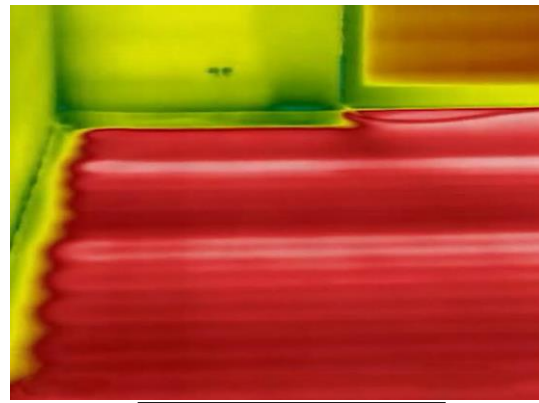
50mm Gyvlon Screed